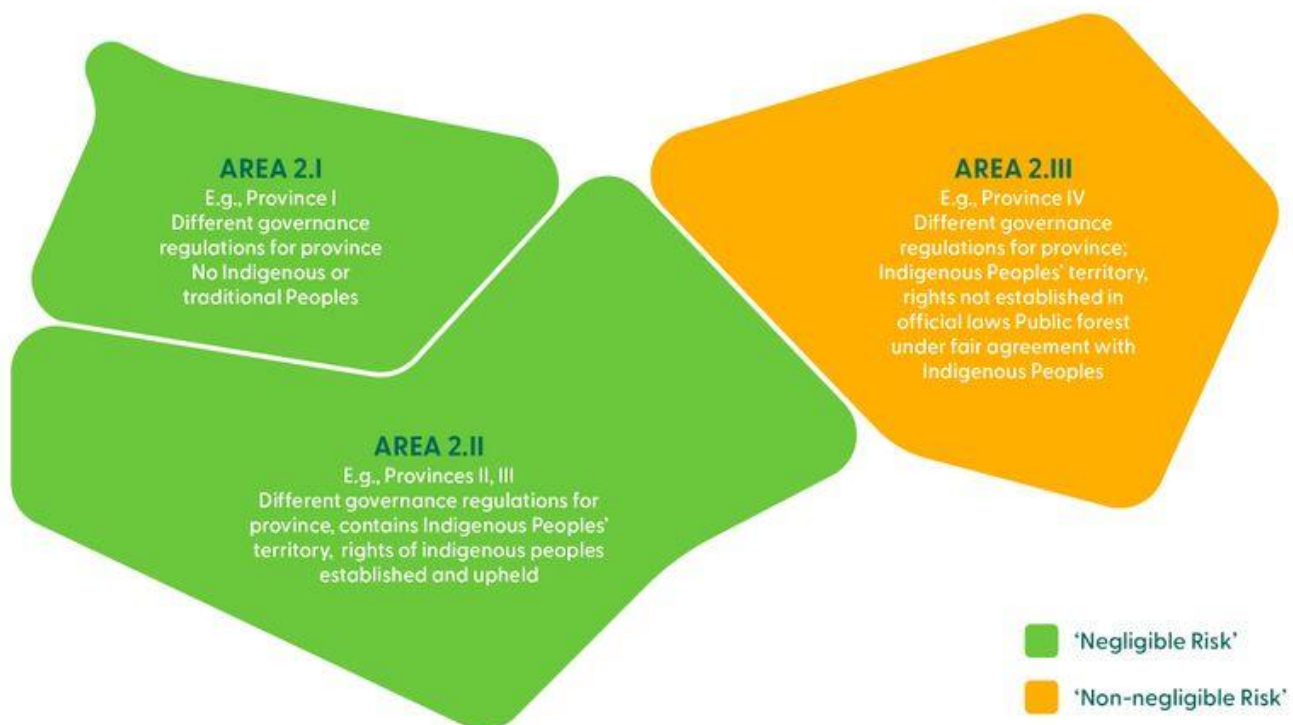
Figure 3. Designation of risks considering geopolitical and functional scales.

Within Province IV, the presence of Indigenous Peoples has been confirmed. The applicable legislation does not cover Indigenous Peoples' rights, and there are no other regulations that would protect the rights of Indigenous Peoples. The mitigation of this risk will require the implementation of FPIC, and evidence of this shall be provided through agreements with the relevant Indigenous Peoples' representatives. In this area, forests are managed by private owners and public authorities. Special agreements have been signed for public forests (PF) between forest managers and Indigenous Peoples' representatives, ensuring the implementation of FPIC. Evidence exists that these agreements are upheld. There is no such agreement signed for private forests. The area is assessed as 'negligible risk' for public forests and as 'non-negligible risk' for other forests.