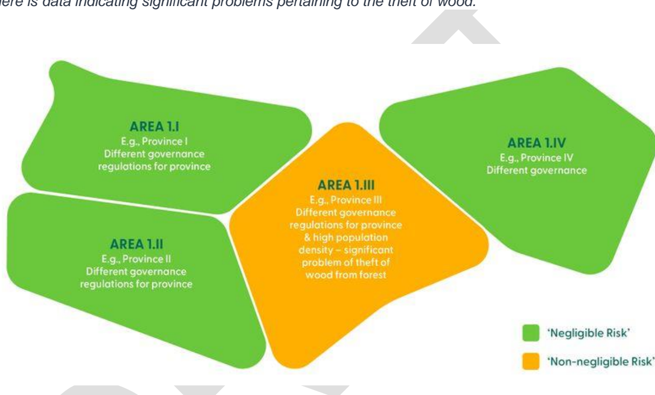
Figure 2. Designation of risks considering geopolitical scale.

The country is divided into 4 provinces, each of which have different provincial laws. The applicable legislation for each province has been identified. Assessment of the enforcement of laws shows that laws are upheld in Provinces I, II and IV however in Province III, which has a high population density, there is data indicating significant problems pertaining to the theft of wood.